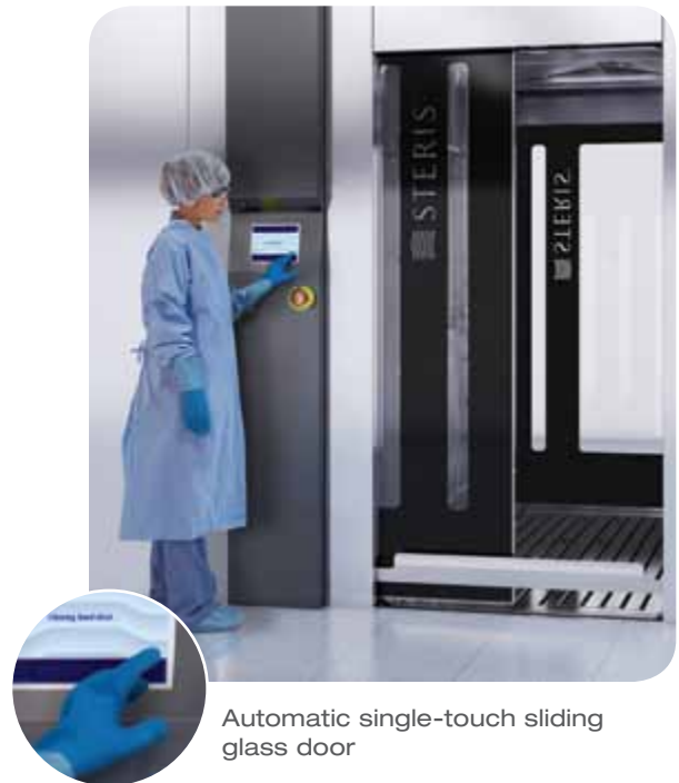
Automatic single-touch sliding glass door