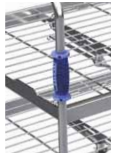
Cool touch handle