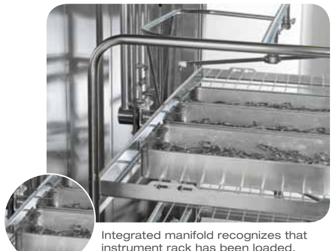
Integrated manifold recognizes that instrument rack has been loaded.