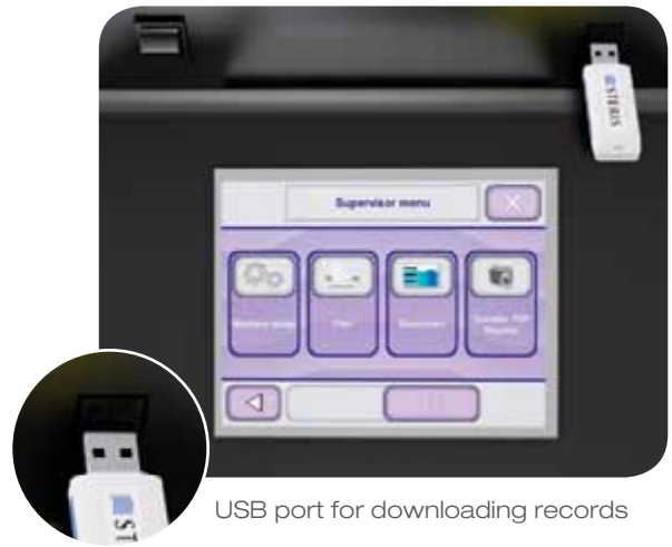
USB port for downloading records